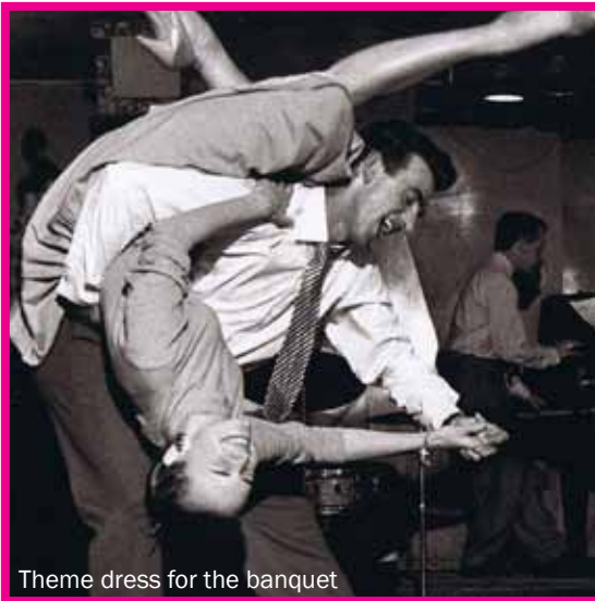
Theme dress for the banquet

NEW this year will be 50/60s themed Extreme Bingo to be played at the start of the banquet and awards ceremony. Bingo cards will be available for purchase at the entrance to the Thurs banquet from 6:45 – 7:00pm for $5 each. If you purchase 3 or more cards you will receive a ticket for each card that enters you into a drawing for a free night stay at the Metropolis Resort. Bingo prizes will include $10 gift cards and other surprises. By participating in this event you are supporting the Scholarship Fundraiser for Activity Professionals who have demonstrated a desire to further their professional knowledge of the activity field.